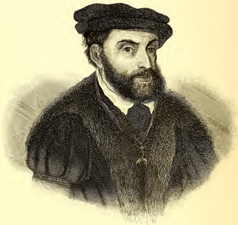
CHARLES THE FIFTH.